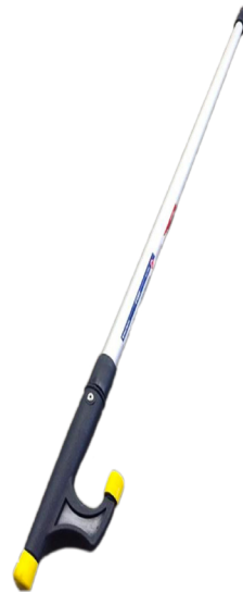
TELESCOPIC GRABBING HOOK DEVICE